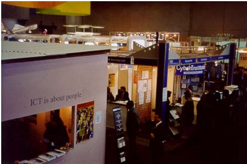
A stand at the ICT4D Exhibition

Among the numerous events organised by civil society networks included the Communication Rights in the Information Society (CRIS) initiative, which hosted a two day World Forum on Communication Rights, to debate and strategise on human rights issues around the WSIS process; the Building Digital Opportunities (BDO) Programme – a collaborative initiative by five international communications organisations to build ICT capacities among poor and marginalized communities; and the Ubuntu initiative – a civil society led campaign to reform international institutions.